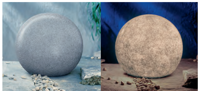
Stone look in granite, (L) during daylight and (R) when lit at night.

Sales Contact: 5 b_Y?cbXY_, President • æ [ ] å^\ O { [ [ ] | ä @ä &æ { or (239) 541-8670