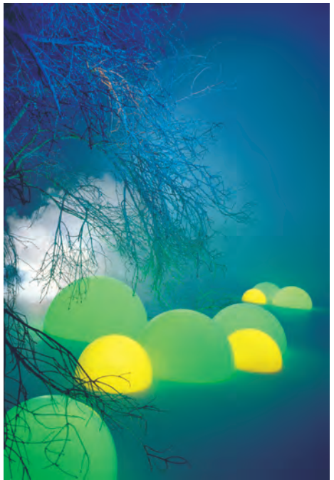
Half globes with green and yellow color filters recessed mounted to the ground. Moonlight® Globe Lights withstand temperatures from 40° below zero to 170° F and are sealed to resist moisture and dust.