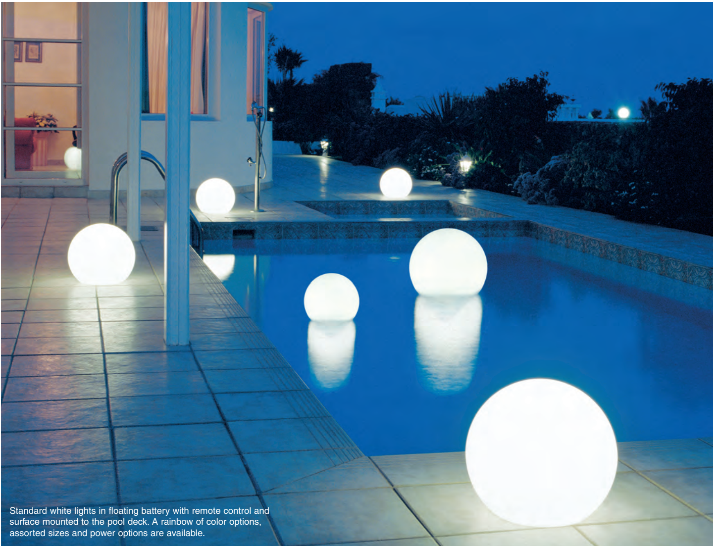
Standard white lights in floating battery with remote control and surface mounted to the pool deck. A rainbow of color options, assorted sizes and power options are available.