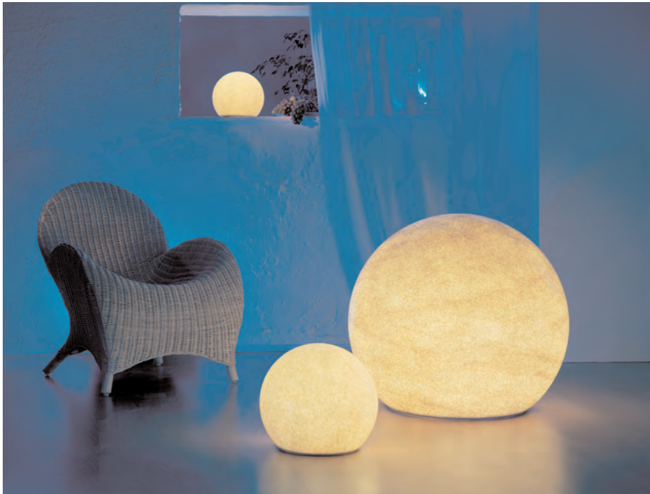
Rechargeable 250, 550 and 750 sandstone lights. These lights look like stone spheres during the day. See our website for more from the natural line.