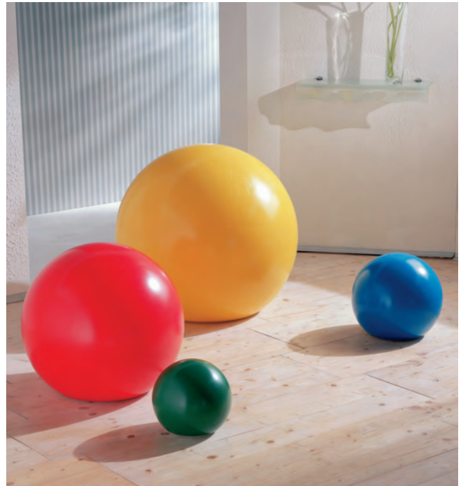
Daylight colors in normal daylight. Corporate color matching is available.

Visit our website at www.moonlight-inc.com to see how Moonlight® can bring the elegance of the world's finest resorts to your home or project. Moonlight® USA, Inc. is the EXCLUSIVE IMPORTER of Germany's award-winning Moonlight® Globe Lights in the United States.