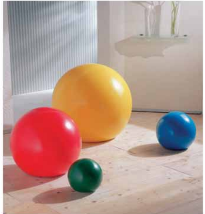
Daylight colors in normal daylight. Corporate color matching is available.

Visit our website at www.moonlight-inc.com to see how Moonlight® can bring the elegance of the world's finest resorts to your home or project. Moonlight® USA, Inc. is the EXCLUSIVE IMPORTER of Germany's award-winning Moonlight® Globe Lights in the United States.