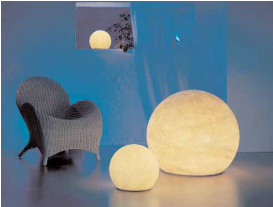
Rechargeable 250, 550 and 750 sandstone lights. These lights look like stone spheres during the day. See our website for more from the natural line.