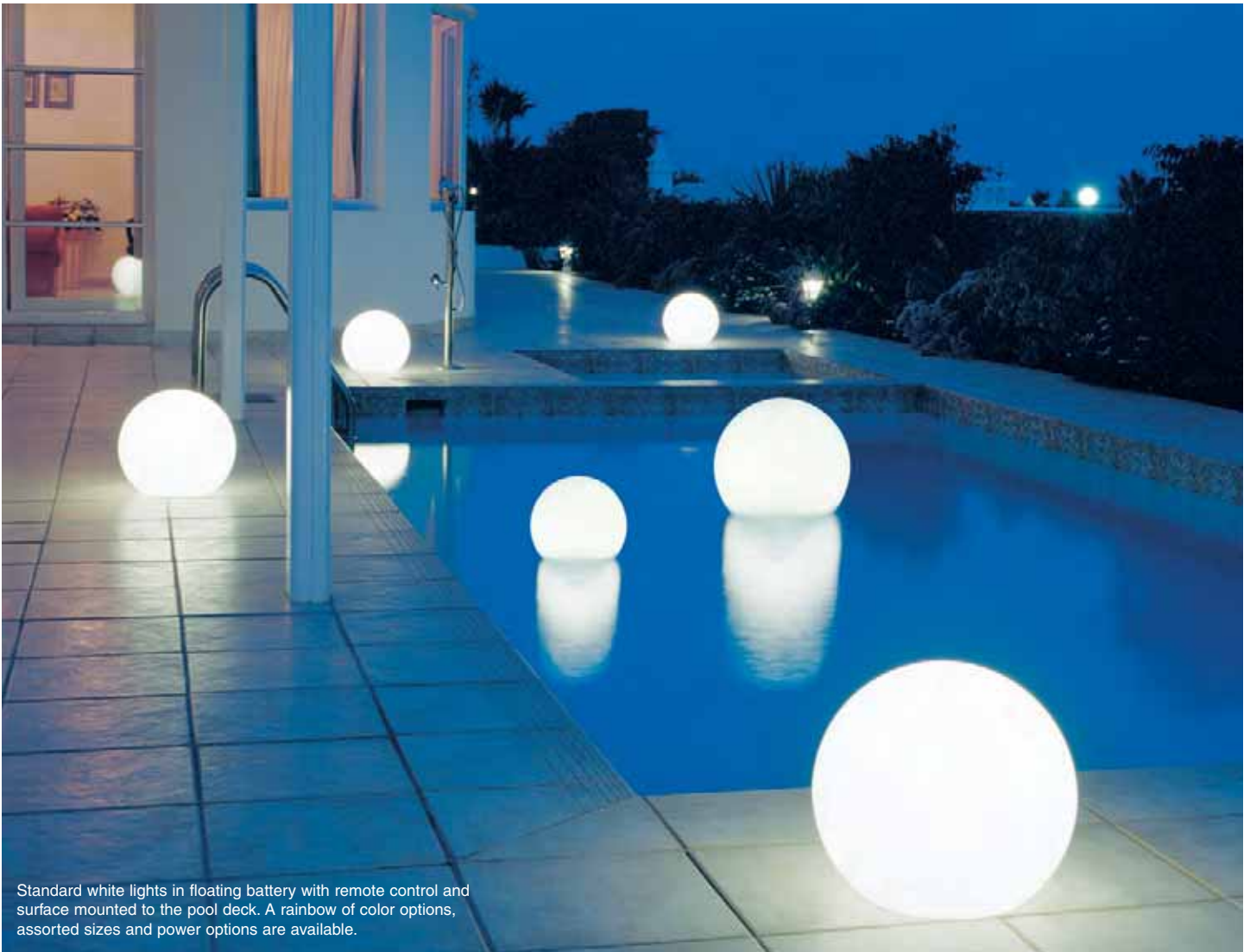
Standard white lights in floating battery with remote control and surface mounted to the pool deck. A rainbow of color options, assorted sizes and power options are available.