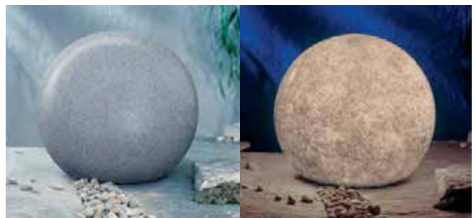
Stone look in granite, (L) during daylight and (R) when lit at night.